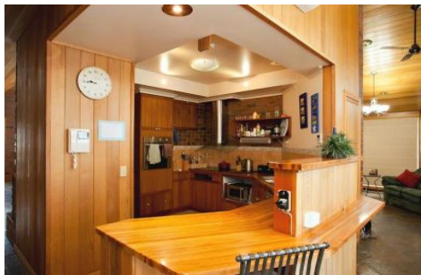
Total Living Area: Approx 23.1 sq