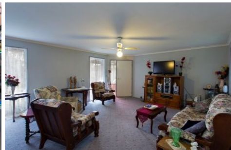
Total Living Area: Approx. 6.5sq